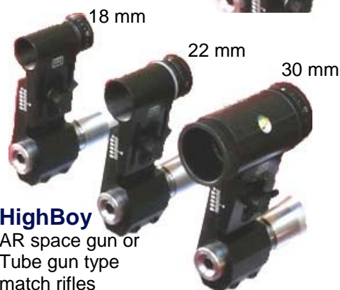
HighBoy AR space gun or Tube gun type match rifles

Both sights are designed for cross course, mid and long-range target shooting with a 200 to 1000 yard range with Serration values within +/- 0.0003 of form tolerance..